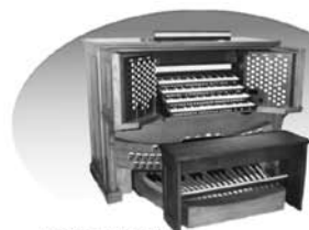
RODGERS® DIGITAL ORGANS PIPE-COMBINATION ORGANS

New 4 Manual Console to be interfaced with 45 Rank Casavant Pipe Organ at Sligo Seventh Day Adventist Church Takoma Park, Maryland