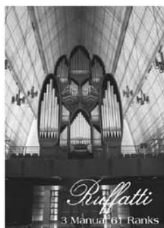
Fratelli Ruffatti Pipe Organs Padua, Italy

New 4 Manual Console to be interfaced with 45 Rank Casavant Pipe Organ at Sligo Seventh Day Adventist Church Takoma Park, Maryland