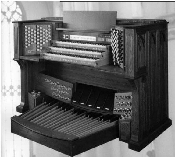
American Classic V 80 Voices, 5 Divisions, Floating Solo

European quality and design now in America